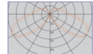
Typical Polar Curve